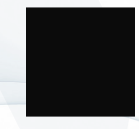
Satin Black (for Legend, Legend Classic and Legend Live)