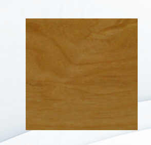
American Alder (for Legend, Legend Live, Legend Solo)