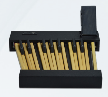
Suitable for Legend Live Metal Stand