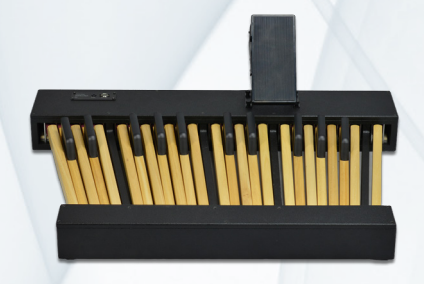
Suitable for Legend Wooden Stand